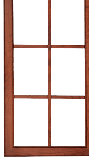
RED OAK // 20G6, SR2, EP3 (GLASS NOT PROVIDED)

CHERRY // M110G6, M105 (GLASS NOT PROVIDED)