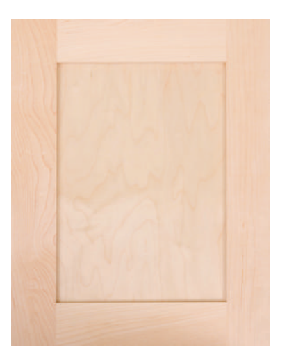
HARD MAPLE // 10F, SR5, 1/4" FLAT, EP8