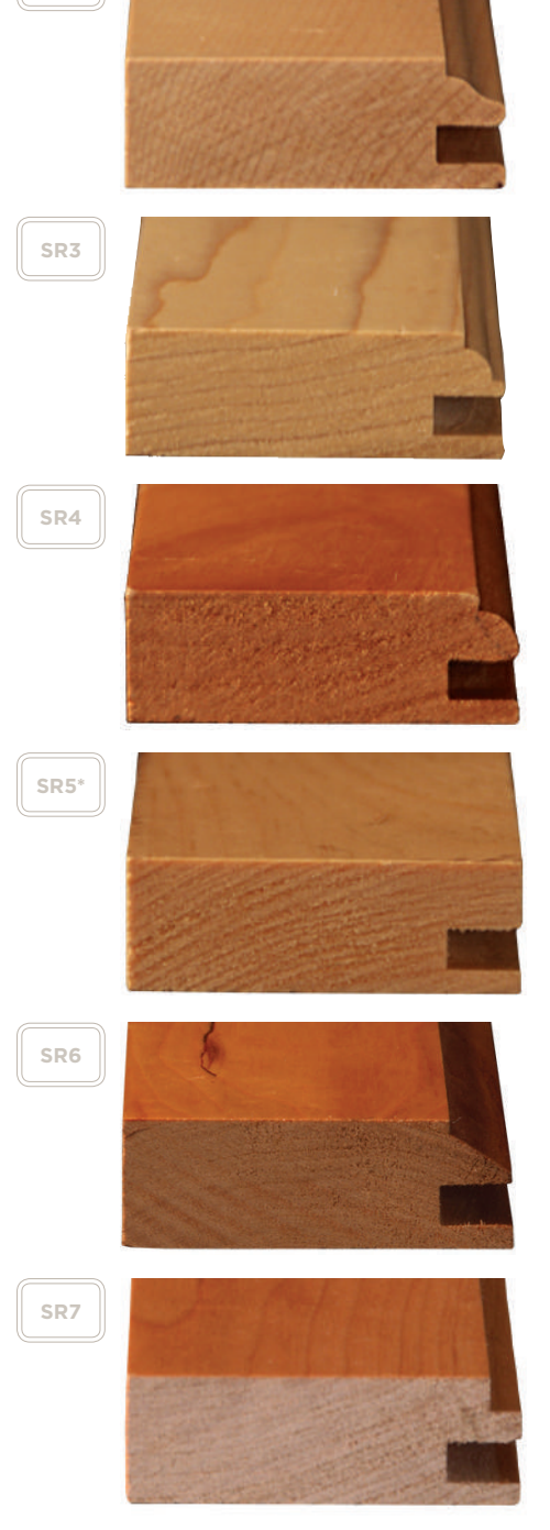
QUARTER SAWN RED OAK 20RD1, SR3, PP4, EP14 (70/30SPLIT)