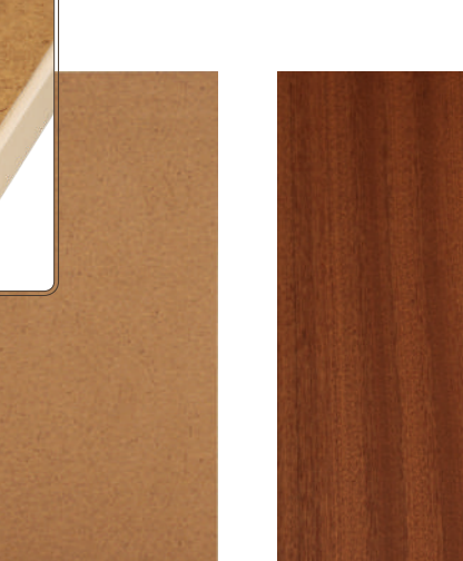
HIGH PRESSURE LAMINATE SLAB WITH 2 MM EDGEBANDING