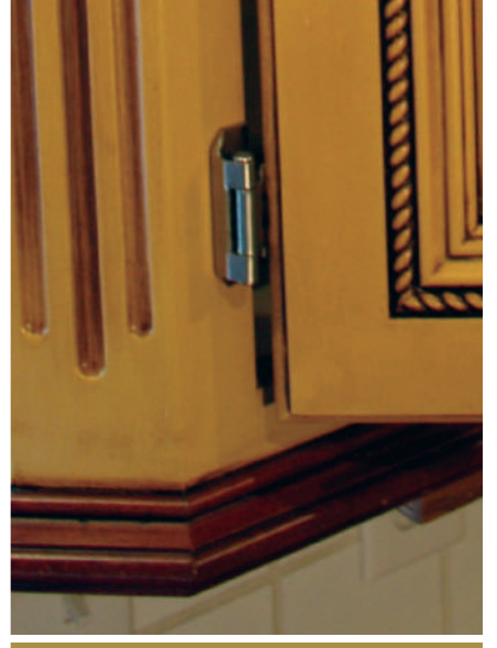
FLUTES // Partial and full flutes add a personalized accent to any room.