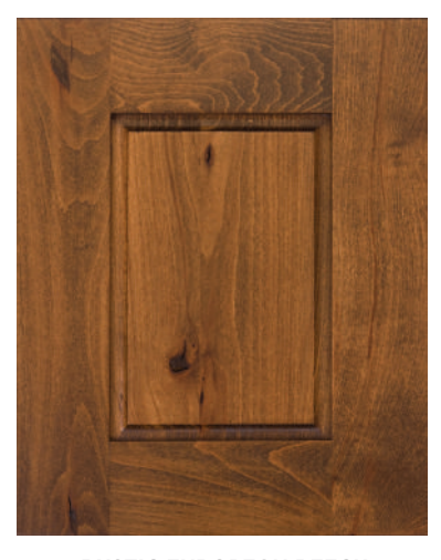
RUSTIC EUROPEAN BEECH 10R, SR5, PP9, EP5