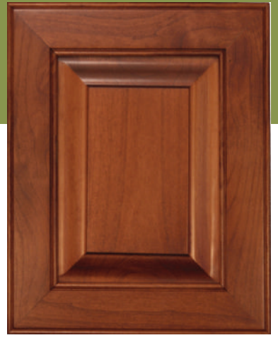
ALDER // M110R, M105, PP3

The trend of mitred doors has grown dramatically.