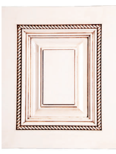
POPLAR STILE AND RAIL AND MDF PANEL M110R WITH ROPE MOUDLING, M108, PP4