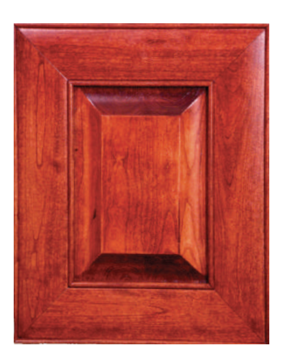
CHERRY // M210R, M109, PP1