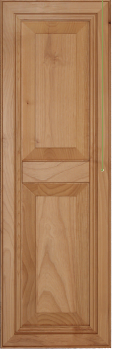
ALDER // M110RD2, M101, PP2 (50/50 SPLIT)