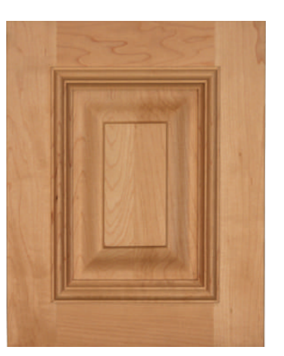
HARD MAPLE // 10R, SR5, PP3, EP1, APM1