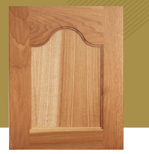
HICKORY // 90F, SR7, FLAT, EP8