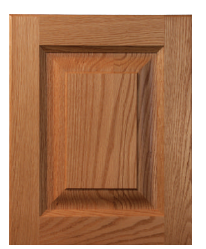
RED OAK // 10R, SR6, PP3, EP5