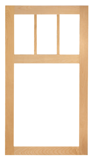
CUSTOM GLASS DOOR WHITE BIRCH // SR5, EP1 (GLASS NOT PROVIDED)