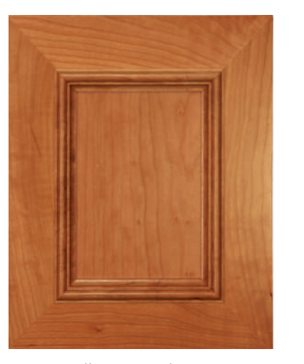
CHERRY // M10F, M5, 1/4" FLAT, APM1