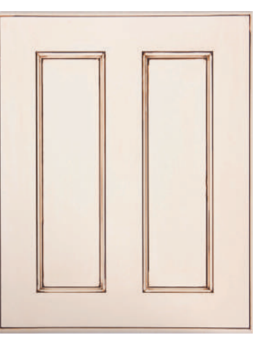
PAINT GRADE // 11F, SR3, 1/4" FLAT, EP3