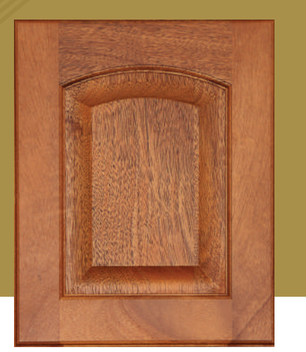
MAHOGANY // 30R , SR3, PP1, EP17