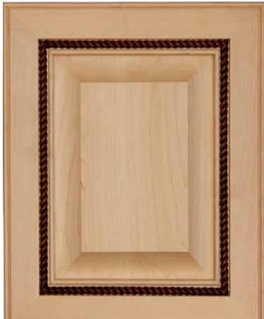
HARD MAPLE WITH CHERRY ROPE MOULDING // M110R, M205, PP1