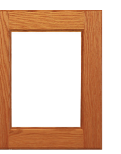
RED OAK // 10G, SR3, EP3 (GLASS NOT PROVIDED)